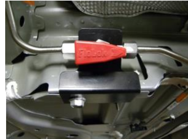
Manual Fuel ¼-Turn Shut-Off Valve ON, allowing fuel flow