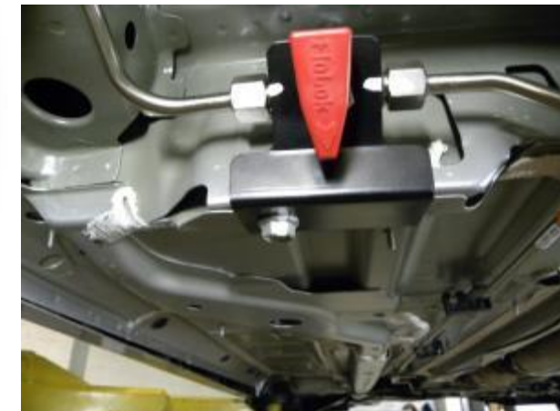
Manual Fuel ¼-Turn Shut-Off Valve OFF, preventing fuel flow